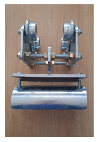
Cable Carrier side view